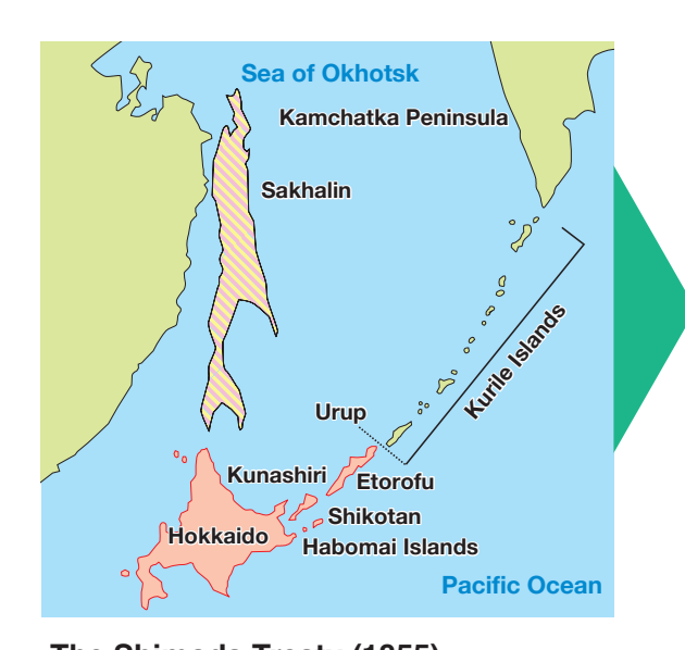
The Shimoda Treaty (1855)