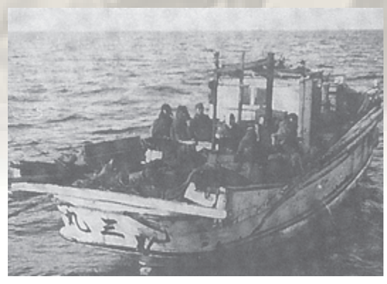
Islanders attempting to flee by fishing boat.

At present, no Japanese Nationals live in the Northern Territories, which is a part of Japanese territory.