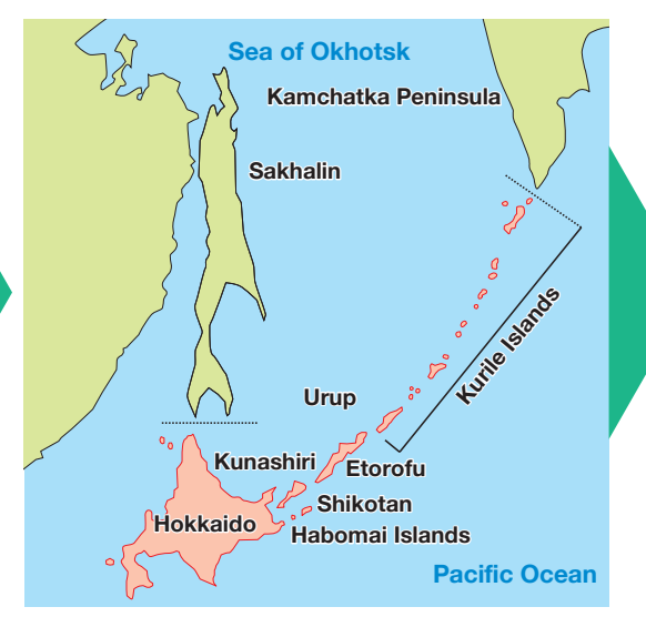
Treaty for the Exchange of Sakhalin for the Kurile Islands (1875)