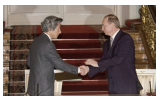
Japan-Russia Action Plan (2003)