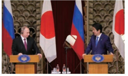
Statement for the press (2016)