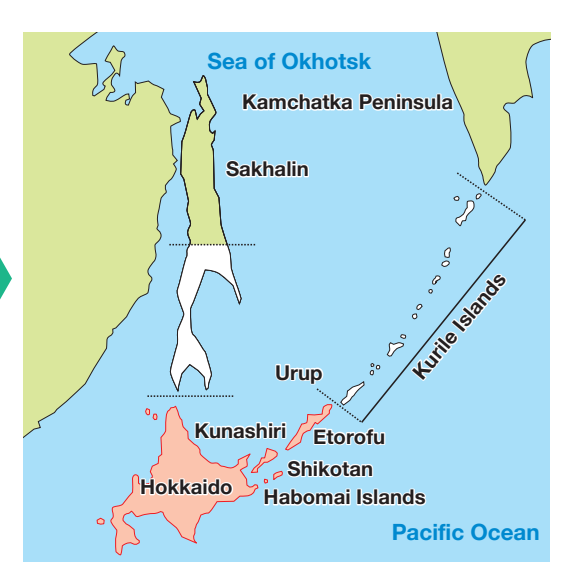
San Francisco Peace Treaty (1951)