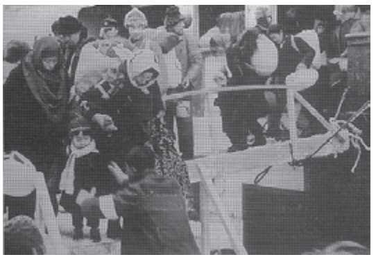
Islanders being deported