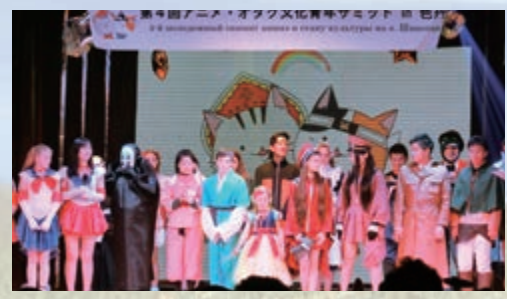
Visit by Japanese citizens (Shikotan cosplay exchange)

As part of efforts to improve the atmosphere for the resolution of the Northern Territories Issue, the four-island exchange program has been carried out in the form of mutual visits without passports or visas in order to promote mutual understanding between the Japanese people and the residents of the Four Northern Islands.